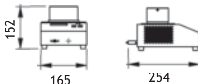
Digital Dry Bath Chiller